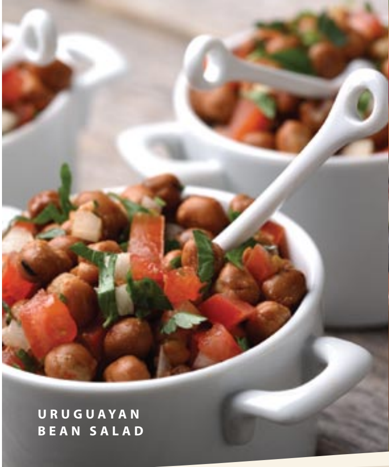
URUGUAYAN BEAN SALAD