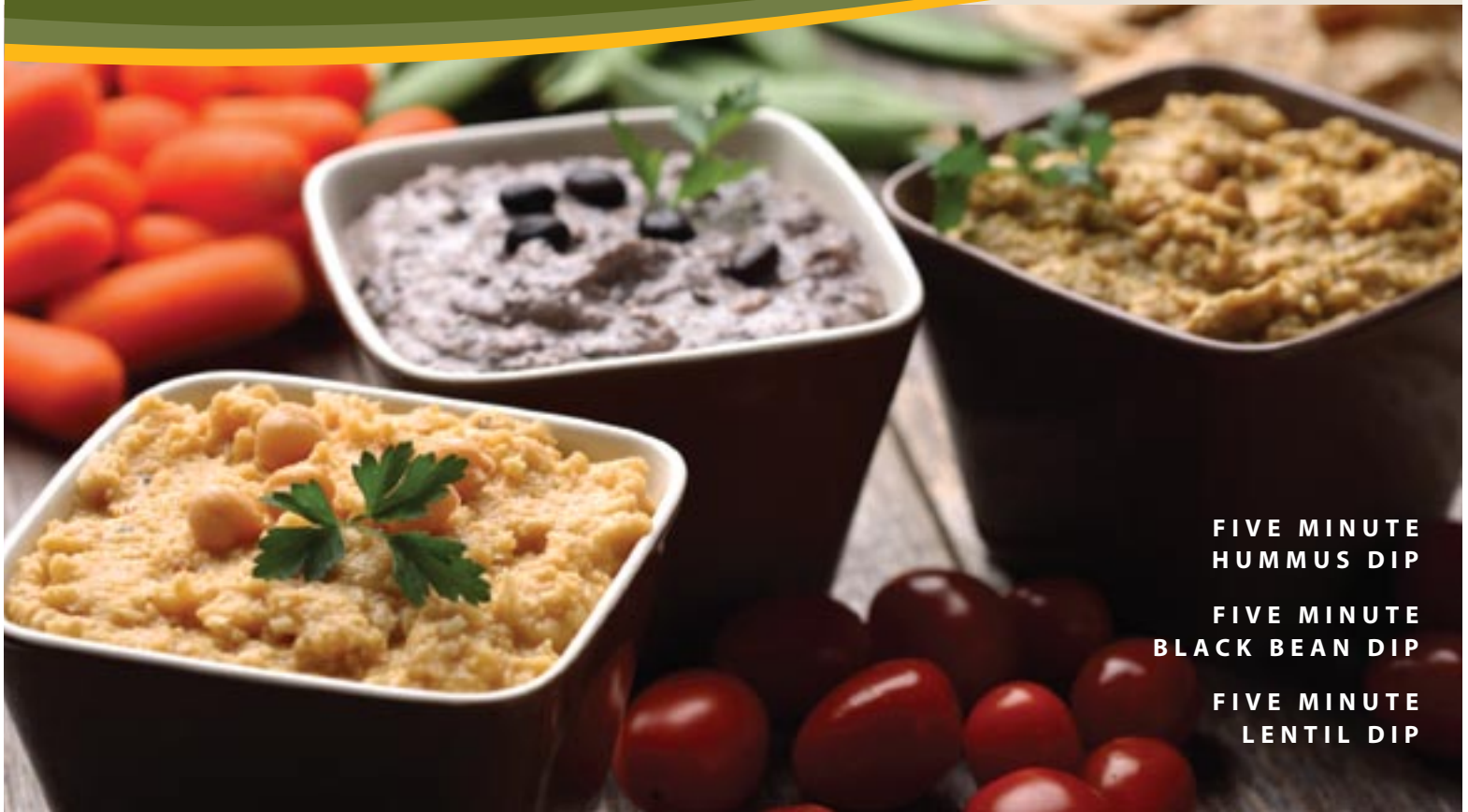
FIVE MINUTE HUMMUS DIP